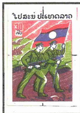
Pathet Lao, 1974 Proof with printer's guidelines Battle of Xieng Khouang