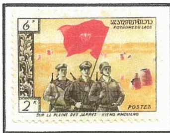
Neutralist, 1961 Armed Forces on the Plain of Jars - Xieng Khouang