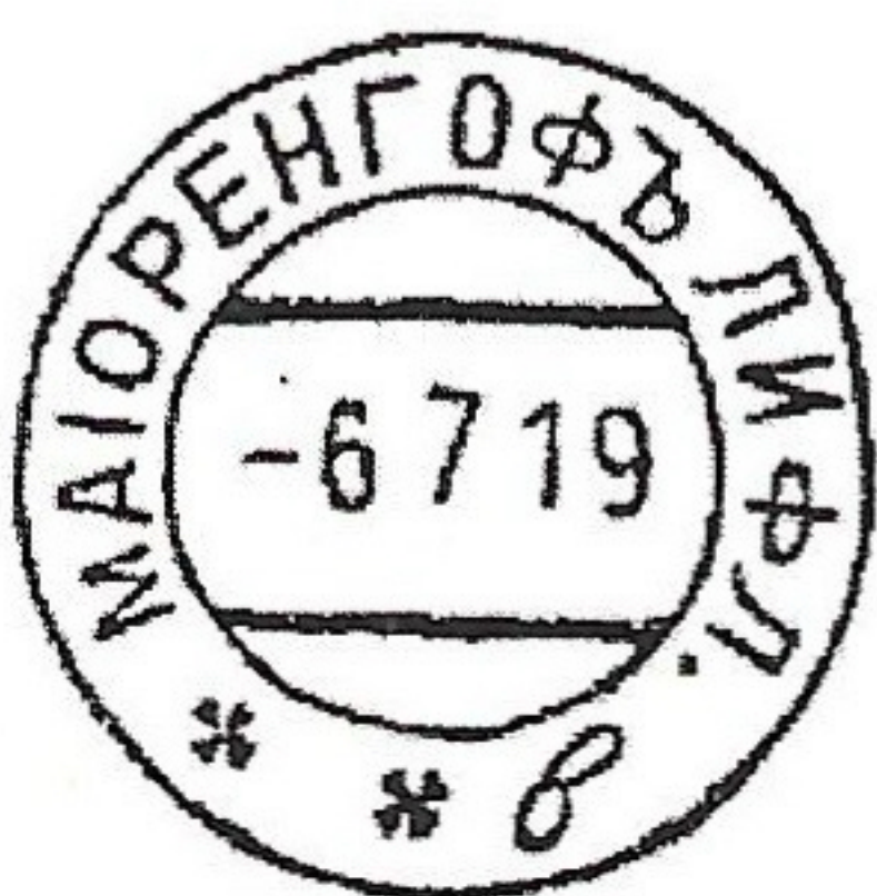
Town & Province In Russian Types