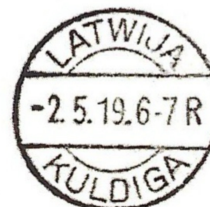
German Type - Town & Country In Latvian Types