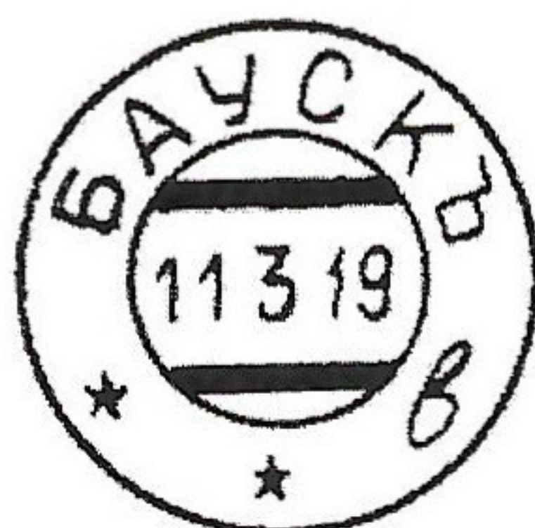
Town & No Province In Russian Types