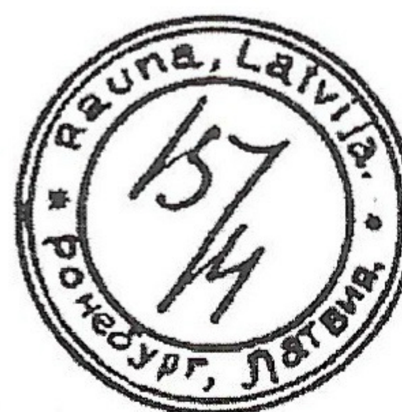
Town & Country In Latvian & Russian Types