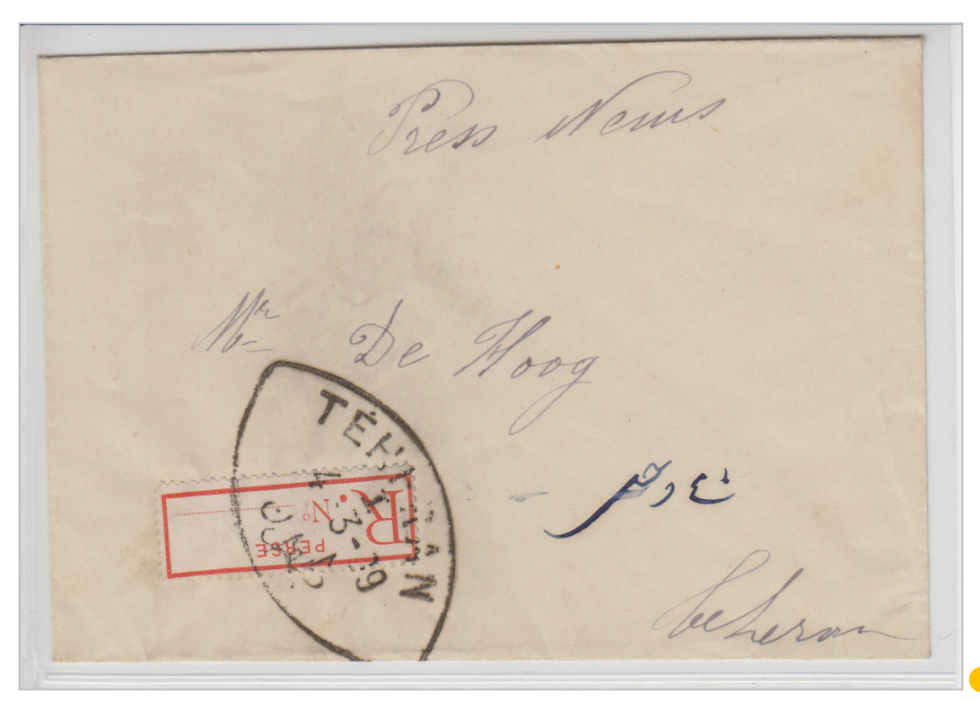
4 March 1909 – Unsealed cover sent to the Teheran Zoo franked with 1\times RL , paying 1ch unsealed local rate, tied with 'TEHERAN 4-3-09' departure postmark.