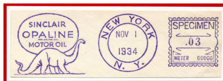
Large dinosaur design (vertical neck and tail) SPECIMEN

Specimens were produced in small numbers.