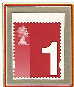
Post Office Red

Because the NVIs were an outgrowth of the Machin series, trial material is largely limited to new technology introduction or regulatory factors. For those reasons, the trials shown are chronologically out of sequence from the first NVI printings.