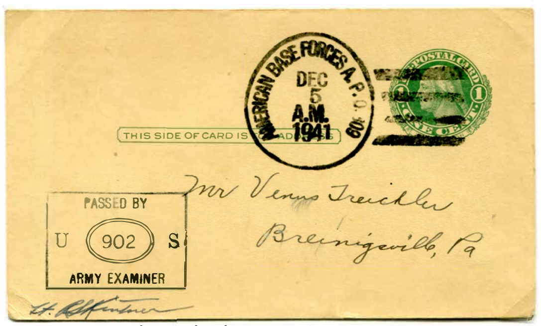
Message Describes Mail Delivery in 1941 – "Dear Brother, Rec'd letters of 10/27 and 11/8 [at] midnite Thanksgiving [20 November]. Being 5 weeks accumulation it is over 200 bags."