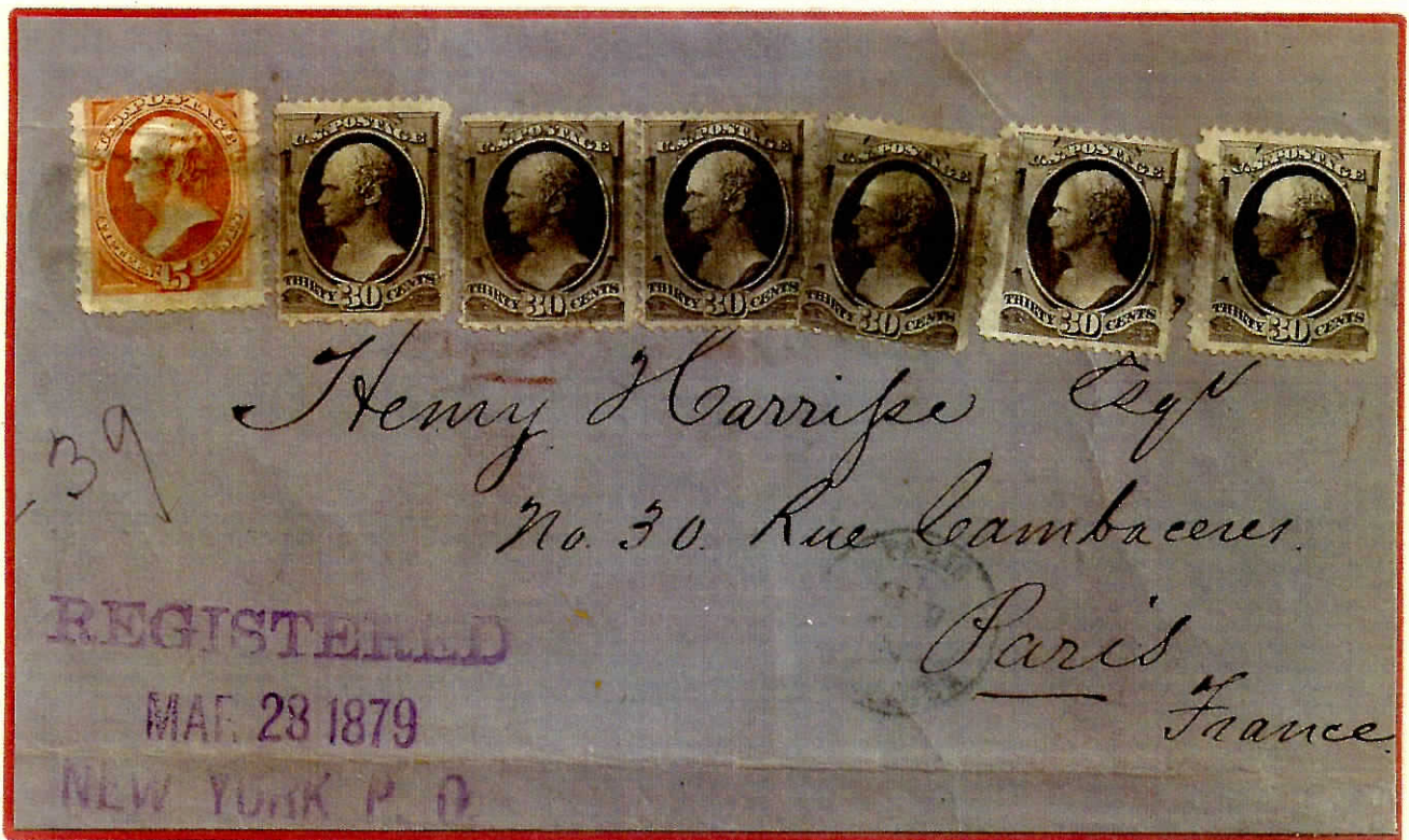
Hamilton 30c National Bank Note pair + four singles with 15c orange (front from registered legal wrapper, March 1879, paid 10c registration fee plus 37x UPU rate from NY to Paris)

The exhibit presents material in chronological order according to the timeline of his life. Many items are contemporary with his lifetime and include examples of free frank covers from him and his associates.